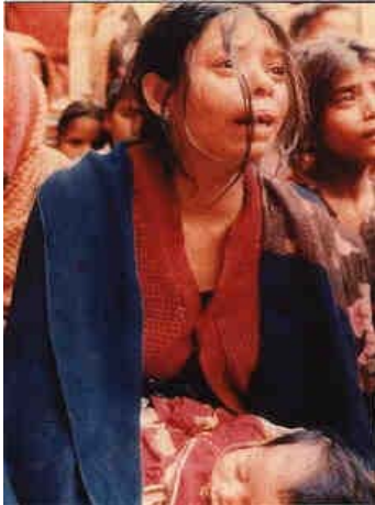
Sikh woman weeps after her husband was burned to death.