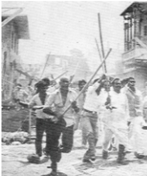
Mob rampage through the streets of Delhi, November 1984.

I was wrong. A document eventually produced by this team - a slim pamphlet entitled Who Are the Guilty - has become a classic, a searing indictment of the politicians who encouraged the riots and the police who allowed the rioters to have their way.