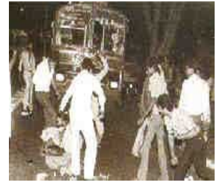
Sikh man being beaten to death.

I remembered the passage because I believed that I, too, was not a joiner, and in Naipaul's pitiless mirror I thought I had seen an aspect of myself rendered visible. Yet as this forlorn little group marched out of the shelter of the compound I did not hesitate for a moment: without a second thought, I joined.