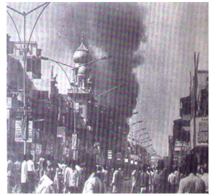
Gurdwara set ablaze.

We were confident that the government would soon act to stop the violence. In India, there is a drill associated with civil disturbances: a curfew is declared; paramilitary units are deployed; in extreme cases the army marches to the stricken areas. No city in India is better equipped to perform this drill than New Delhi, with its huge security apparatus. We learned later that in some cities – Calcutta, for example, the state authorities did act promptly to prevent violence. But in New Delhi – and much of North India – hours followed without a response.