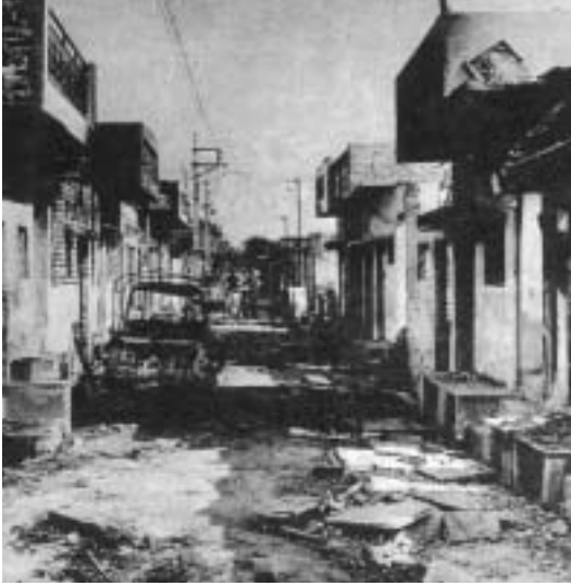
Aftermath of the massacre in Trilokpuri, East Delhi