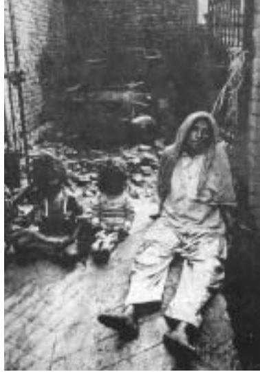
Widow and orphans of the massacres